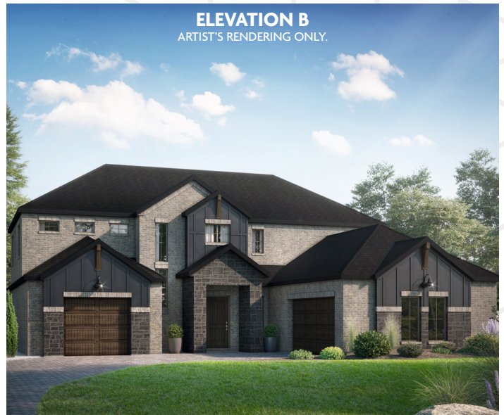
ELEVATION B ARTIST'S RENDERING ONLY.